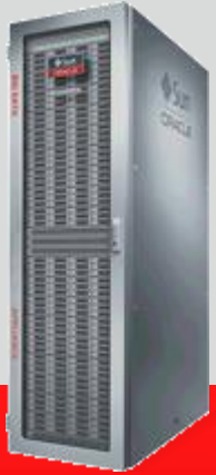
Big Data Appliance