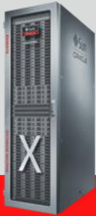
Exalogic Elastic Cloud