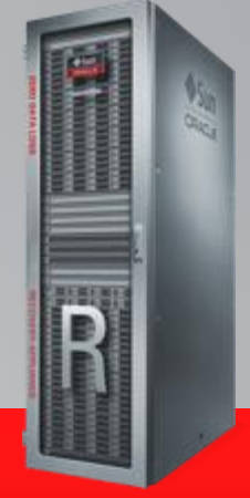
Zero Data Loss Recovery Appliance