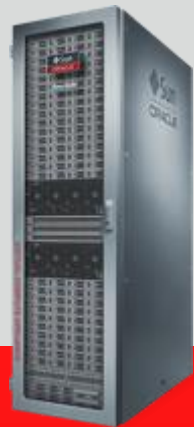
Virtual Compute Appliance